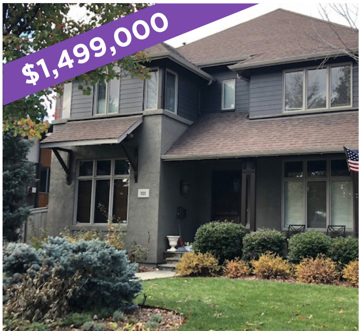
Coming Soon: 921 Olive St.

And a thank you to everyone in our school and neighborhood community who attended our annual neighborhood fundraiser – at Harvest Party – at the Molkery. We nearly hit our fundraising goal, however funds are still trickling in. With the live music, fun auction items, teacher support, and community merriment, this was definitely a success. To put numbers to it, we are very close to our goal of $12,000!